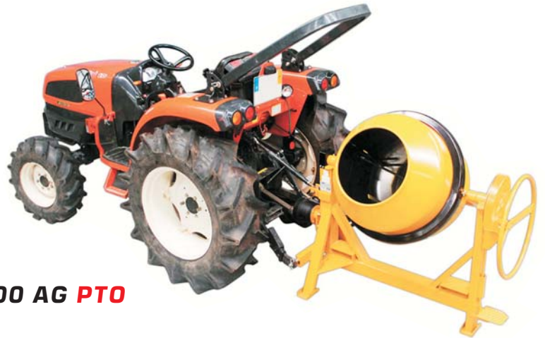
BP 400 AG PTO