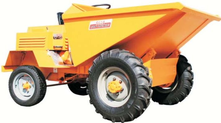
DM 1000 2RM 4x2

Ian Dickie's range of Silla Dumpers are well known throughout the world for being reliable and easy to maintain. There are many versions and we are able to offer configurations that will fulfill most concrete placing duties. These heavy duty robust machines are well suited for off – road and construction site duty. They are offered in Two Wheel and Four Wheel Drive with articulated centre pivot chassis and heavy duty braking. Models are available with the option of forward tipping, high discharge and turntable skips. Wide or narrow mouth skips are also available.