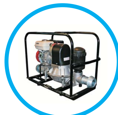
BF80 Single Diaphragm Sludge