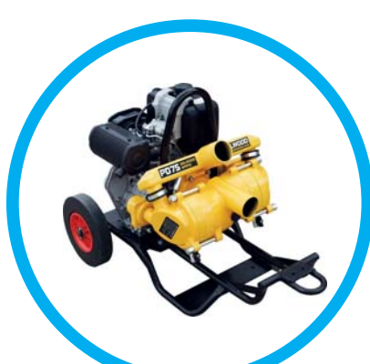
PD75 Positive Displacement