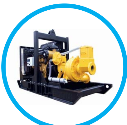
H150 High Head

Our wide range of general purpose and specialist prime assisted centrifugal pumps are available in a variety of forms with diesel, petrol or hydraulic drive options, ensuring that you receive the most effective pump solution for every requirement.