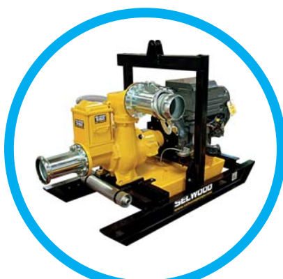
S100 /S150 Solids Handling