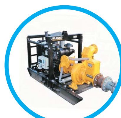
S150 M Solids Handling